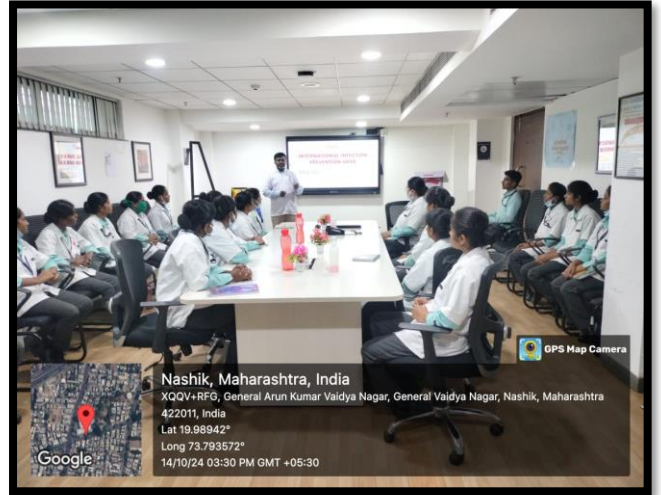
Speech By Nurse Educator